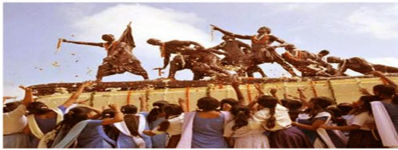
Patna's iconic Shaheed Smarak or Martyr's Memorial

If you have ever visited through the city's corridors, you are no stranger to the life-size bronze statues of seven men. Dressed in dhoti-kurtas with the quintessential Gandhi topi (cap), the statues face the Old Patna Secretariat, a symbol of the event that transpired 76 years ago.