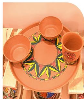
Manjusha Thali Set