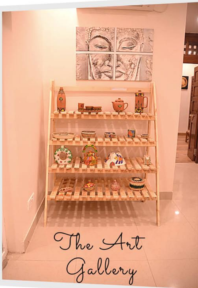
The Art Gallery